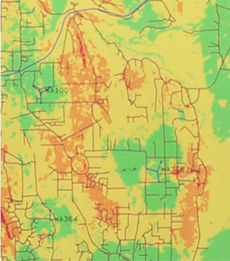
Proposed 150' Jordan Tower